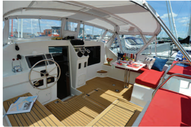
Cockpit - This huge Cockpit with its clever two-tier seating is a revelation in a boat of this size. There is ample space to stand, sit, sunbathe, relax or dine in complete comfort.