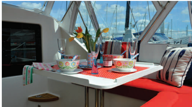
High style onboard – just add sea and sunshine for the perfect atmosphere.