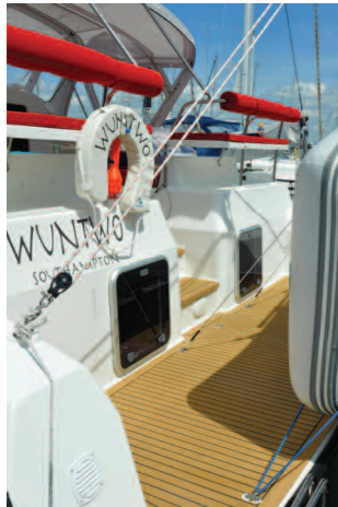
Swimming Deck - A first for a Catamaran, yet more luxurious space across the entire width of the boat. Great for swimming, diving and sunbathing.