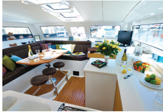
The Saloon/Galley is spacious, light and luxuriously appointed. A large, comfortable corner sofa surrounds a natural oak table, and the generously sized galley has ample workspace, and raised shelving, as well as high and low cupboards. Throughout, all round, laminated glass windows, and big skylights offer panoramic views, and add to the feeling of immense space

When combined with the optional second head this allows up to 8 people to sleep aboard and enjoy the facilities of two heads and two showers - all in a 10m catamaran.