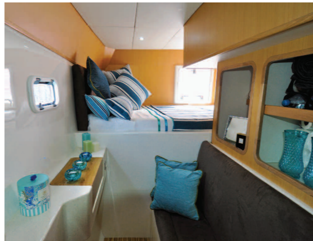
Aft Cabin - Assured comfort, space and style with a king sized berth, complete with comfortable upholstered headboard, a natural oak shelf, oak framed storage compartments, generous hanging space and even a small sofa.